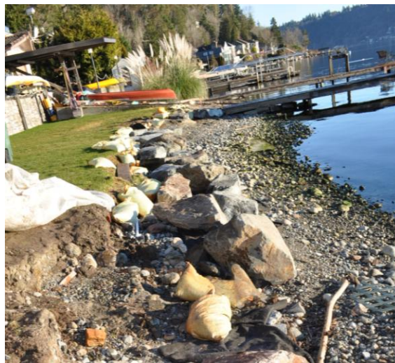
Soft Stabilization Fails Under Our Lake Conditions